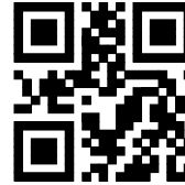
QR Code 2005