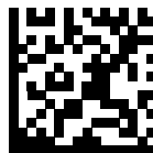
Figure 3 Data Matrix