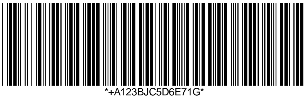
Figure 2. Code 39

Note: the figures in this document are here as examples only, and due to the nature of the document their resolution may not conform to the specifications that are needed when using these symbols in a working environment