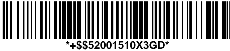
Figure 5. Code 128

Shown below are examples of the symbols for the HIBC LIC Secondary Code Data Structure. They are based on the primary message in example 4.3.1, +A123BJC5D6E71G. In this case, the Link character ('L' in table 2) is G, and the Check character in the example below is D.