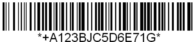
Figure 1. Code 128

Shown below are examples of the symbols for the HIBC LIC Primary Data Structure.