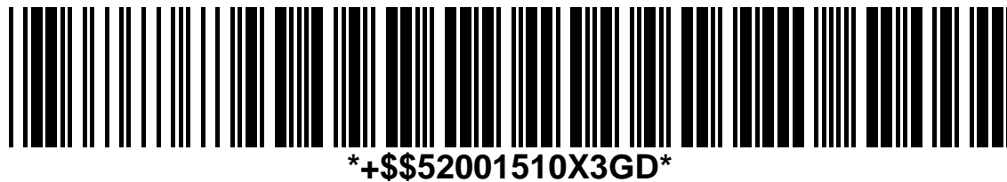
Figure 6. Code 39